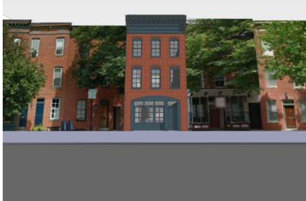
Looking East from Bond Street