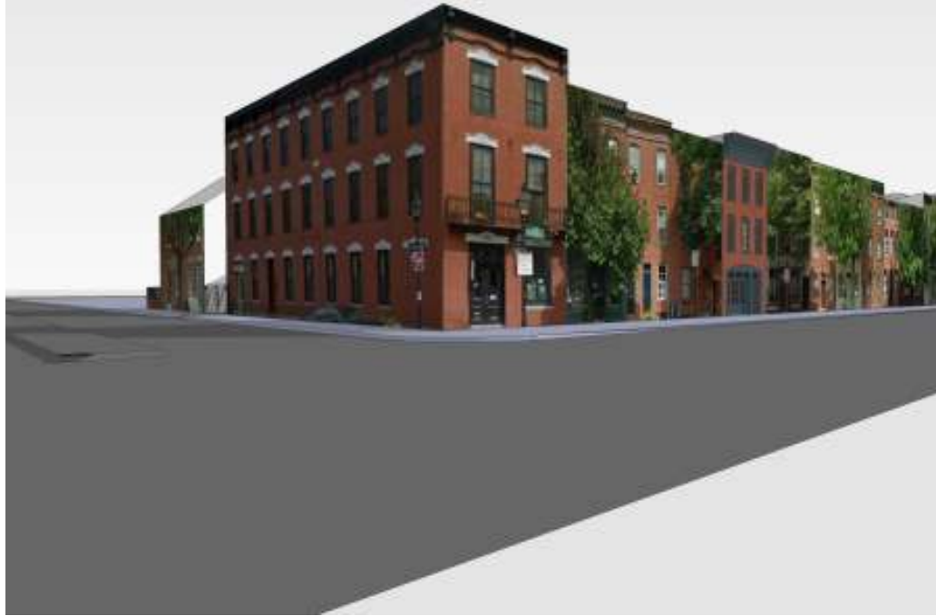
Looking Southeast from Bond Street