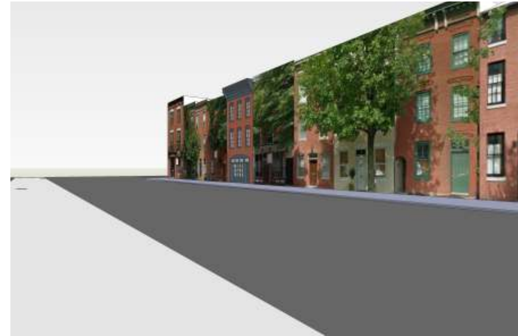
Looking Northeast from Bond Street